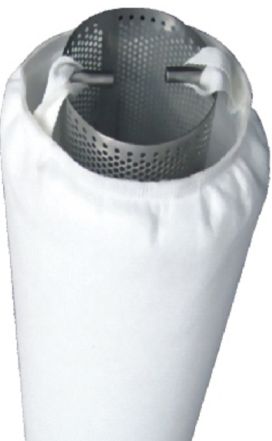
III. Bag Bottom Tie Knobs